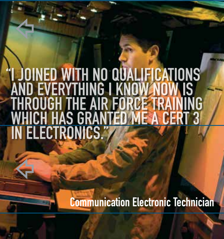
Communication Electronic Technician

THERE ISN'T JUST ONE AIR FORCE CAREER. AND THERE ISN'T JUST ONE WAY TO JOIN UP.