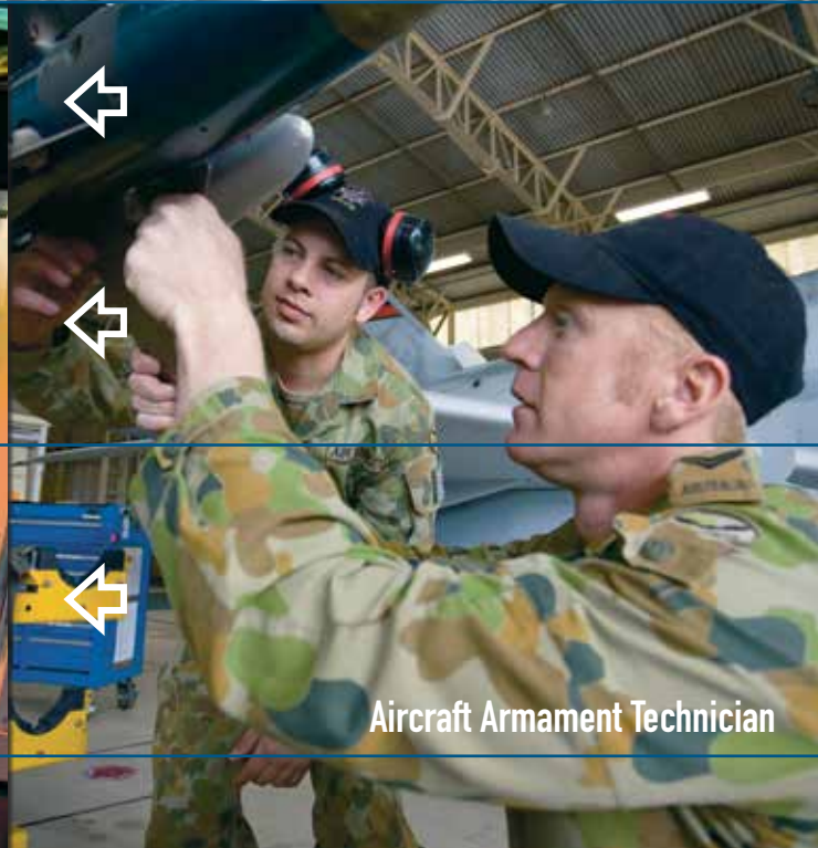
Aircraft Armament Technician